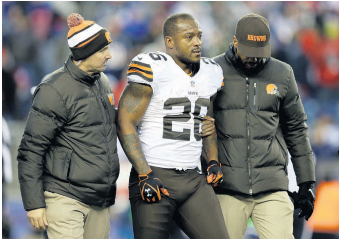
Cleveland Browns running back Willis McGahee is helped from the field after getting injured in the fourth quarter of an NFL football game against the New England Patriots on Dec. 8, 2013, in Foxborough, Mass.